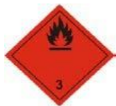
3 - Flammable liquid